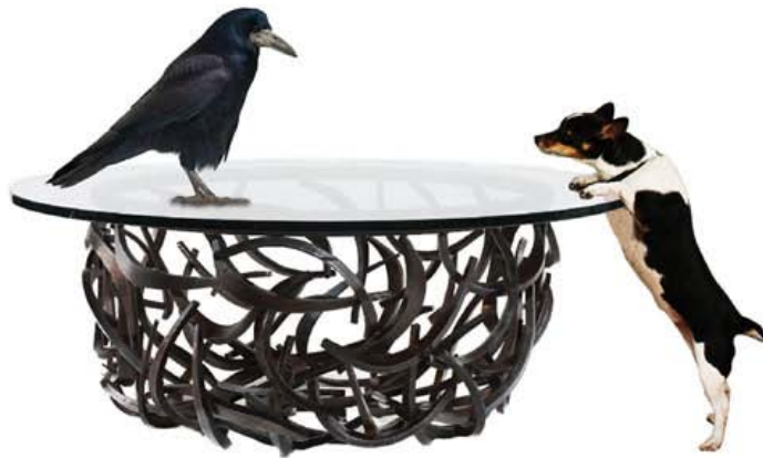
BIRD'S NEST COCKTAIL TABLE BY KOLKKA